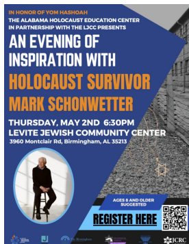
MAY 2 Levite Jewish Community Center - Alabama

Join us on May 2nd at 6:30pm with the Alabama Holocaust Education Center for an evening of inspiration as we prepare for Yom HaShoah, the worldwide day of Holocaust remembrance.