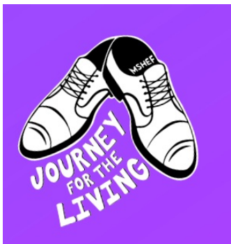
MAY 2024 Journey For The Living

Join Us to Network, Learn and Gain Inspiration. View Full Calendar